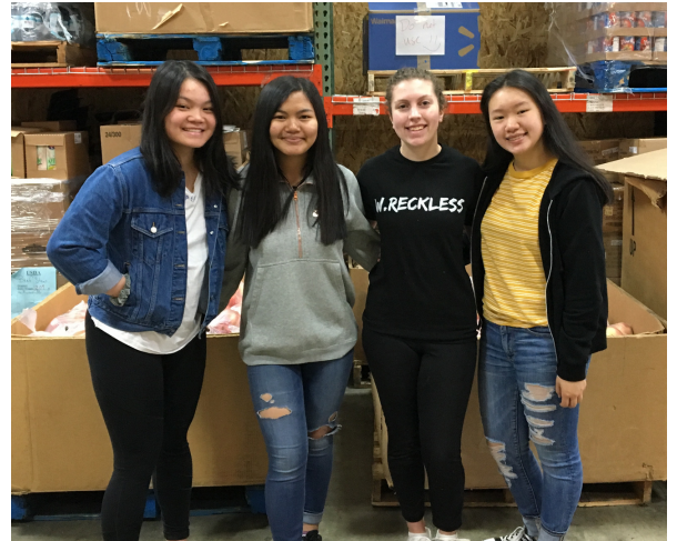
Smiling Centennial NHS students

NHS and ASB student groups have always encouraged members to volunteer in their community to help make it a better place, and SnowCap is thrilled to be the place where they are choosing to serve.