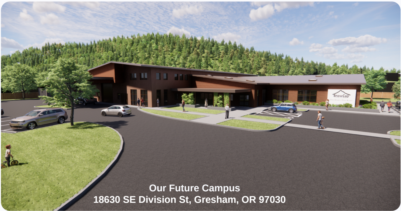
Our Future Campus 18630 SE Division St, Gresham, OR 97030